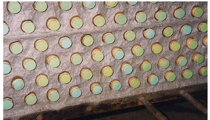
Special ENECON coating plugs installed after grit blasting to facilitate the application of the CeramAlloy system.