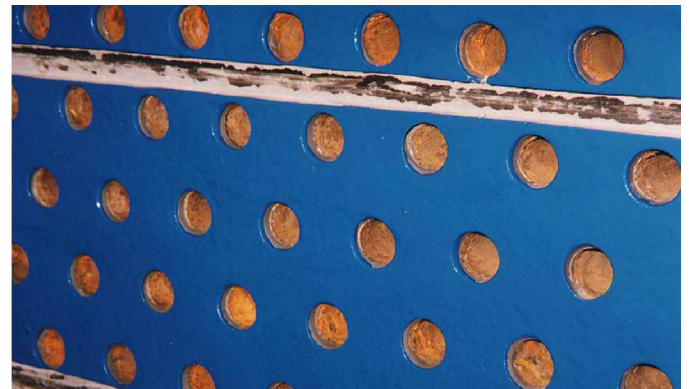
CeramAlloy CL+ applied to complete the project.