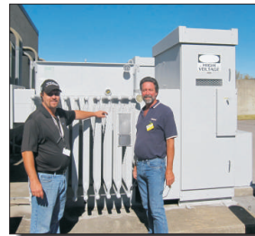
ENESEAL CR & HR applications