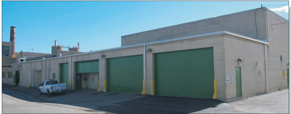
ENESEAL CR on doors