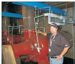
CeramAlloy on pumps