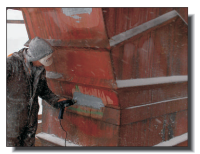
SpeedAlloy being applied.