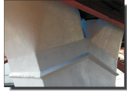
DurAlloy applied over entire extractor shell.