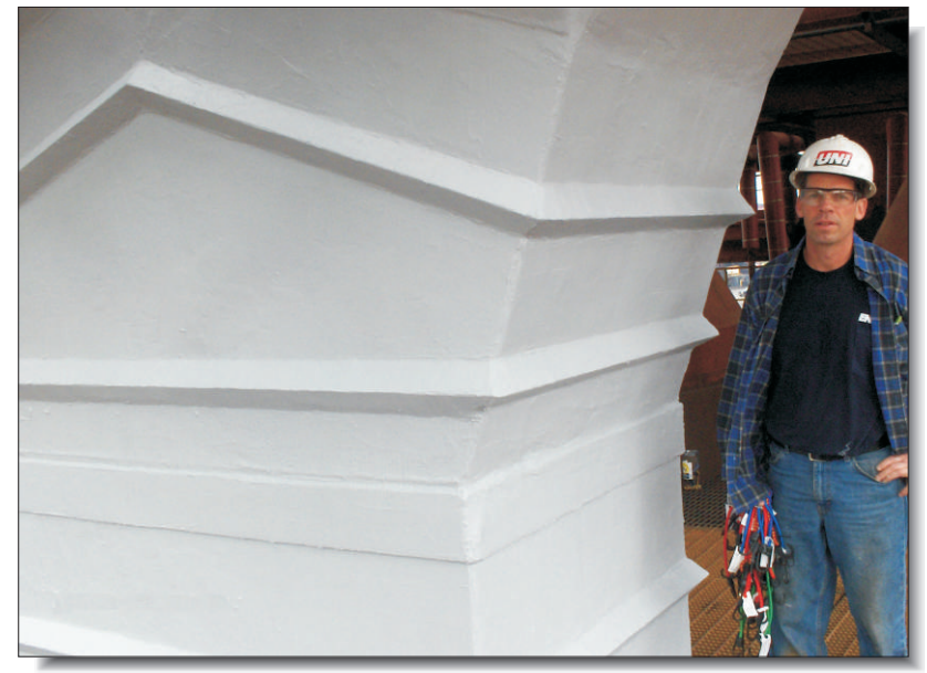
After totally encapsulating the unit in DurAlloy, ENESEAL CR was used to provide optimum corrosion resistance and a uniform look.

6 Platinum Court • Medford, NY 11763 Toll Free: 888-4-ENECON • Phone: 516-349-0022 • Fax: 516-349-5522 www.enecon.com • info@enecon.com