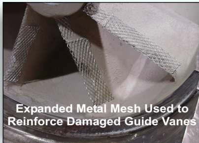
Expanded Metal Mesh Used to Reinforce Damaged Guide Vanes