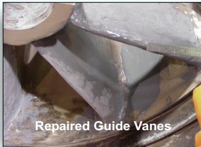
Repaired Guide Vanes