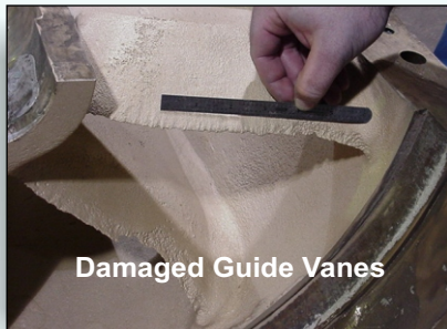
Damaged Guide Vanes