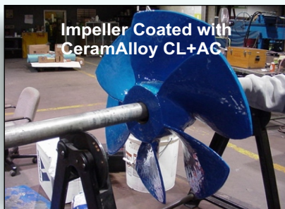
Impeller Coated with CeramAlloy CL+AG