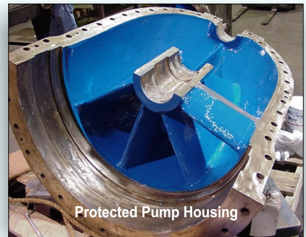
Protected Pump Housing

illustrate a typical ENECON pump repair and coating procedure that was carried out in just a few days and cost the U.S. Navy just $12,000.