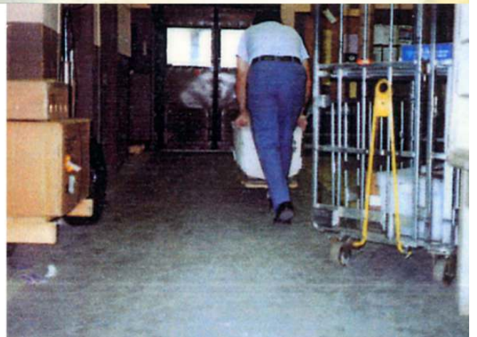
DuraQuartz providing years of trouble-free performance at Postal Center loading area.