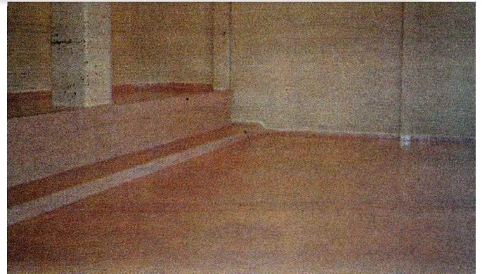
4. The first coat of CHEMCLAD SC (tan color) applied to the entire floor area of the hazardous waste storage