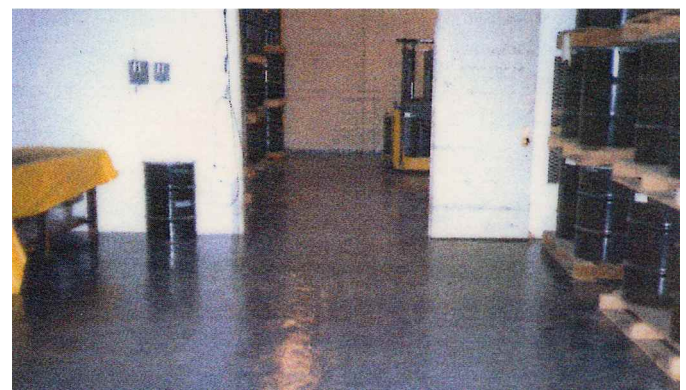
6. The university's waste storage area back in service!