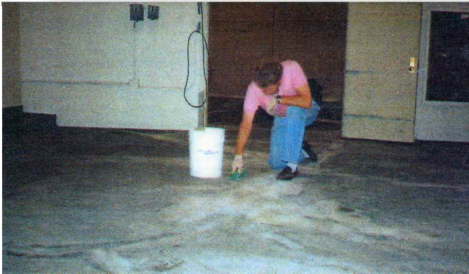
1. An ENECON Field Engineer shows how to make tough floor repairs look easy with DuraQuartz.