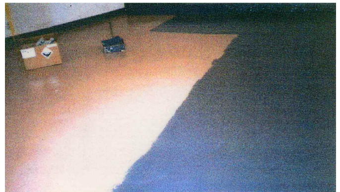
5. The second coat of CHEMCLAD SC (grey color) being applied over the entire floor area.