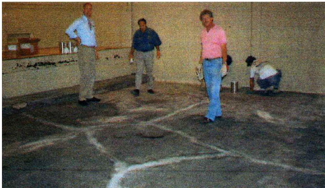
2. A final inspection before the application of CHEMCLAD P4C Primer over the previously repaired concrete floor.